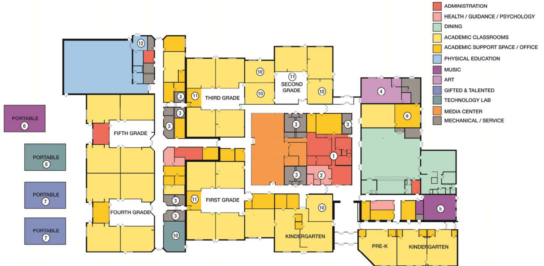
EXISTING FLOOR PLAN