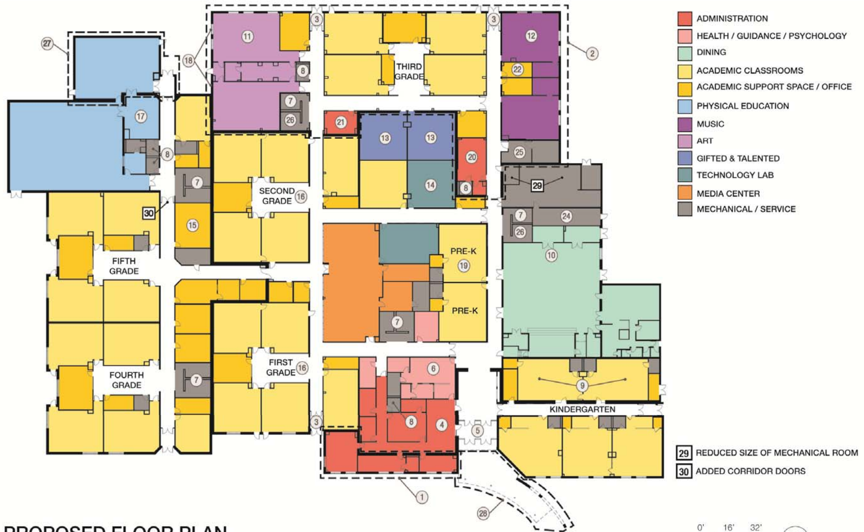
PROPOSED FLOOR PLAN