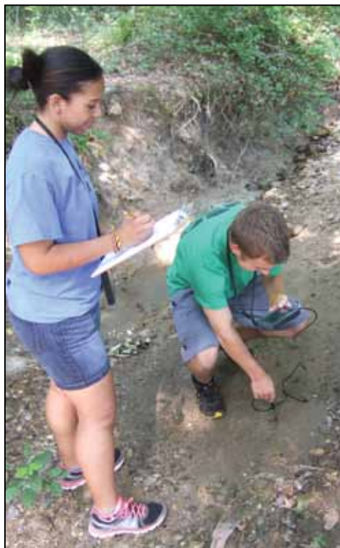
Wilde Lake High School biology students evaluate stream conditions in real time, using calorimetric probes acquired with help from a Bright Minds grant.

“We’re working to ‘raise the floor’ of technology so all students and families can fully participate in every aspect of the educational process.”