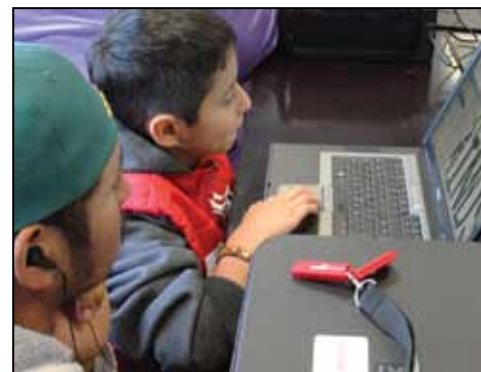
Families learn basic computer and financial skills at a workshop sponsored by the Bright Minds Foundation in partnership with GANTECH, Inc. and Capital One Bank . Bright Minds donates laptop computers, printers and accessories to selected HCPSS students and families, narrowing the digital divide for those lacking technology access at home.