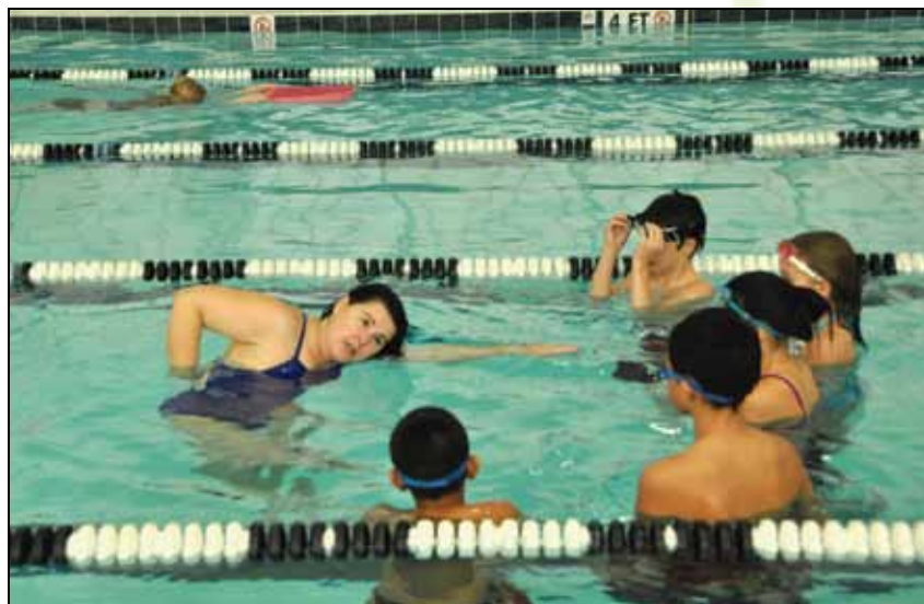
Wilde Lake Middle sixth graders practice swimming skills at the Columbia Swim Center while Long Reach High freshmen take part in a run-bike duathlon at the school. The events were part of Learn2Tri, a program sponsored by TriColumbia to introduce students to the experience and lifestyle benefits of triathlon activities.

A partnership with Healthy Howard, Inc. helps the school system create an environment of health and wellness that engages the entire school community. Healthy Howard offers a Healthy Schools accreditation program to recognize schools that demonstrate a commitment to improving health and well-being. Healthy Howard also provides wellness-related newsletters, resources and technical assistance to support the HCPSS Employee Wellness program.