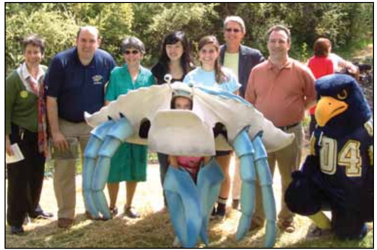
River Hill High students and staff join Green Building Institute and other community representatives to celebrate the opening of the school's new rain garden.

Association of Community Services of Howard County Howard County Mental Health Authority Big Brothers Big Sisters of Central Maryland Howard County Office of Children's Services Christ Church Link Howard County School Health Council Community Action Council of Howard County, MD, Inc. Integrative Counseling Community Action Council of Howard County, Prepare for Success Judy Center at Cradlerock School Counselors Helping (South) Asians/Indians, Inc. (CHAI) Maryland Department of Juvenile Services Family and Children's Services of Central Maryland Mediation & Conflict Resolution Center (MCRC) at Howard Community College Grassroots Crisis Intervention Center, Inc. MSA-The Child & Adolescent Center Head Start of Howard County, Community Action Council National Alliance on Mental Illness (NAMI) Howard County Department of Police, Youth Division PTA Council of Howard County Howard County Department of Social Services Salazar Catering Services/Boardroom Café Howard County Health Department Volunteer Center Serving Howard County Way Station, Inc. - Howard County