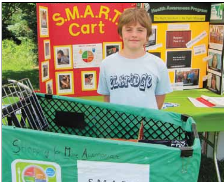
An Elkridge Elementary student demonstrates his S.M.A.R.T. ("Shopping for More Appropriate Rations-of-food for the Table") Cart at the Howard County Family Wellness Day. He designed the cart to assist grocery shoppers in choosing the recommended amounts of each food group.

Dedicated community organizations, governmental agencies, and faith-based groups work with the Howard County Public School System's Office of Student, Family, and Community Services to support student achievement. Services provided include tutoring, mentoring, career exploration, and social and cultural experiences. Organizations that partnered with the Office of Student, Family, and Community Services during 2011-12 included: