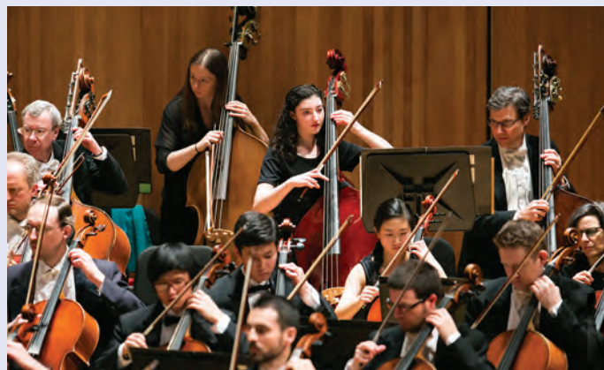
More than 100 HCPSS high school students joined the Baltimore Symphony Orchestra for a side-by-side concert. The collaboration provides inspiration, mentorship and a world-class concert experience for the young musicians.

Brighton Gardens of Columbia Brookfield Christian School of Clarksville Brunswick Zone Normandy Buckle Buffalo Wild Wings Checkers Chick-fil-A, Executive Park Drive Chick-fil-A, Johns Hopkins Road Chick-fil-A, Mall in Columbia Chipotle Mexican Grill, Inc., Old Dobbin Lane Chuck E. Cheese's Clarks Ace Hardware Cold Stone Creamery Columbia Association Columbia Montessori School Community Action Council of Howard County, MD, Inc. Dick's Sporting Goods, Inc. Digestive Disease Associates P.A. Dolly's Car Wash Domino's Pizza, Baltimore National Pike Dunkin' Donuts, Baltimore National Pike Elkridge Furnace Inn Elkridge Youth Organization Elville and Associates Engine Parts Warehouse Inc. Five Guys, Inc. Foot Locker Frisco Tap House Gap Kids Giant Food, Dorsey Hall Drive Giant Food, Marshalee Drive Glory Days Grill