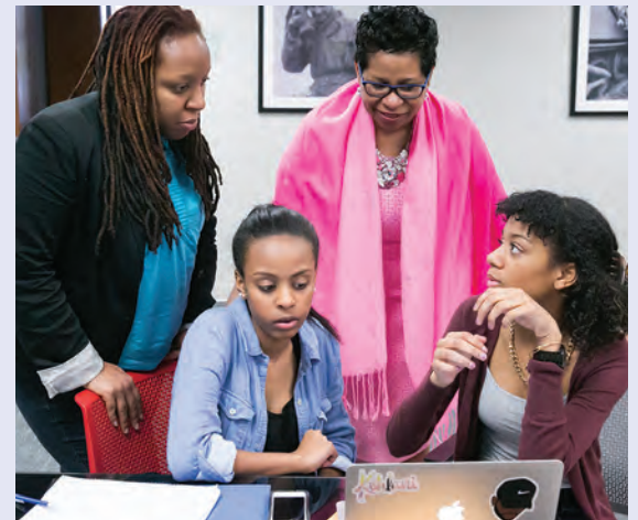
Local professional women from bts Software Solutions , Maryland Center for Entrepreneurship and other businesses bring real content and practical applications to young female entrepreneurs in the JA Rising Women program.

The new JA Rising Women program gives high school girls an opportunity to get a jump-start on running their own successful business. The girls conceptualize an idea for a product or service, capitalize their venture, market the offerings, and analyze the returns. A grant from the Women's Giving Circle of Howard County , a fund of the Community Foundation of Howard County , supports the program.