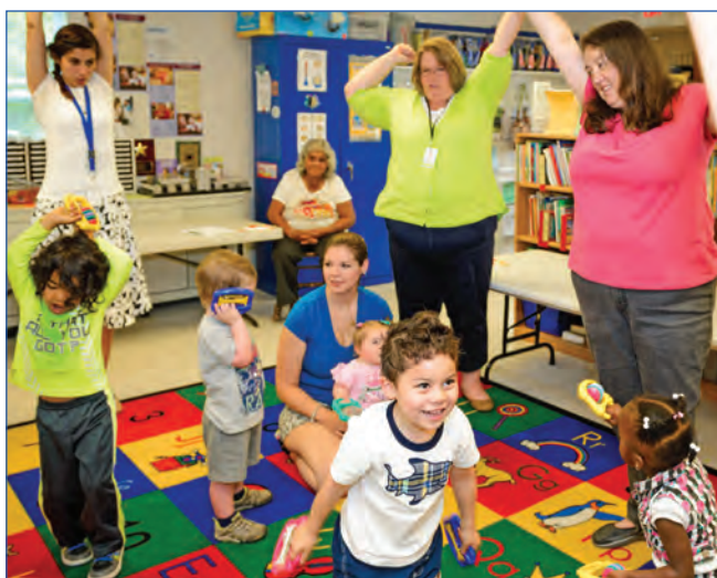
Two- and three-year-old preschoolers at the Judy Center move to "I'm going to shake my sillies out" in the Terrific Tots program provided by the Howard County Department of Recreation and Parks.

The Judy Center ensures that students are ready for school through the support of a wide variety of partners including East Columbia Preschool, Family and Children's Services of Central Maryland, FIRN, Inc., Howard County Office of Children's Services, Owen Brown Community Association, Ready At Five and more.