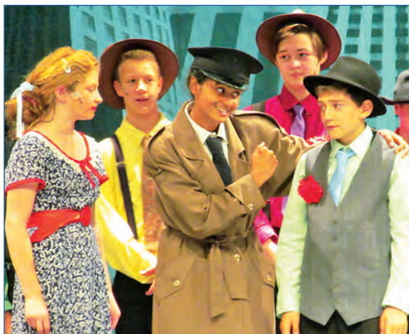
For more than 40 years the Howard County Summer Theatre has been producing high quality, family-friendly summer musicals that provide a wide variety of theatrical opportunities for students of all ages. The Theatre also supports students by donating a portion of its ticket sales to Prepare for Success , a school supplies backpack program of the Community Action Council of Howard County, Maryland, Inc.

Participation in the fine arts is a way for students to "unplug" from a world that is increasingly hyper-connected. In addition to data that supports the premise that fine arts is a key component in improving learning, studies are finding a positive link between the arts and well-being in everyday life.