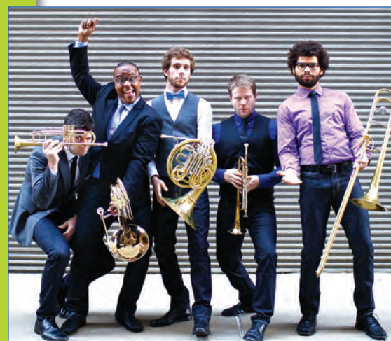
The Candlelight Concert Society provides internationally renowned artists, such as C Street Brass Band, for school workshops.

Hundreds of HCPSS middle and elementary school students armed with nets, smartphones and collection jars canvassed Howard County's Belmont Manor and Historic Park during the weeklong HCPSS BioBlitz program sponsored by the Howard County Conservancy . Using comprehensive GPS and mapping applications, more than 30 volunteer teachers, conservancy biologists and community members joined the students to discover, count, map and learn about the biodiversity in the county's newest park. Students engaged in hands-on learning as they observed and catalogued species of birds, mammals, insects and plants.