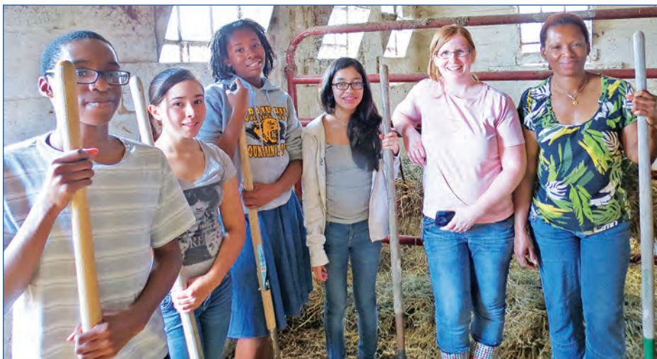
Each year the Howard County Economic Development Authority arranges for Murray Hill Middle School students to become farmers for a day at a local farm. Students tour the farm and take an active part in daily farm duties and chores.

E ducation is among the most valuable community assets in Howard County. Residents take pride in the top-tier school system, which, in conjunction with the number one library system in the nation, joins an award-winning community college to provide a premier educational environment. The accolades for our schools and libraries inspire many in the community to reach even higher. Businesses, non-profit organizations, education institutions and government agencies provide significant support to HCPSS students and staff through generous donations of time, expertise and financial contributions.