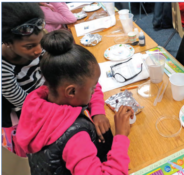
Delta Sigma Theta Sorority partners with Guilford Elementary School to promote STEM skills for students in preparation for higher education and career readiness.