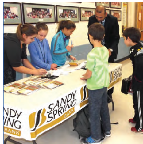
Student tellers accept deposits at the Sandy Spring Bank in-school bank at Pointers Run Elementary.

Many local banks, including The Columbia Bank , PNC Bank and Sandy Spring Bank partner with schools to conduct in-school banks and help students learn financial planning and math skills needed for daily life. Fourth and fifth grade students serve as the tellers for the in-school banks. Bank representatives and other financial partners such as Capital One Bank , Howard Bank , Howard County Education Federal Credit Union , MassMutual of Greater Washington , Merrill Lynch , Northwest Savings Bank and Voya Financial participate in career days and the HCPSS Applications and Research Laboratory's centralized career academies to share information about career options in the banking industry.