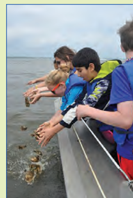
The Center for Green Schools at the U.S. Green Building Council awarded Dunloggin Oyster Gardeners a 2014 Best of Green Schools award. Dunloggin Middle School partners with Kentmorr Marina on the Eastern Shore to care for and relocate nearly 12,000 oyster spat as part of an initiative to help clean the Chesapeake Bay.

Howard County was one of just nine districts nationally and the only Maryland system to win the 2015 U.S. Department of Education Green Ribbon Schools District Sustainability award. Fifty Howard County schools have earned the Maryland Association for Environmental and Outdoor Education (MAEOE) Maryland Green School award, which provides Green School Certification to schools who have met stringent criteria in curriculum and instruction, best management practices and community involvement in environmental education.