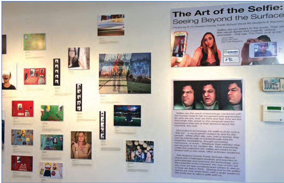
"The Art of the Selfie: Seeing Beyond the Surface" was one of the recent Columbia Art Center HCPSS exhibits. Students and a handful of staff expressed their personal identity through selfie portraits.

K eeping schools safe and secure is a communitywide collaborative effort. HCPSS is fortunate to have many strong practices and partnerships in place dedicated to student and staff well-being.