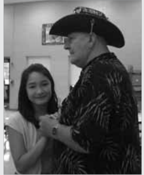
Seniors mingle with students at the Clarksville Middle School annual "Senior Prom."

The information provided is confidential and will not be shared outside of the Howard County Public School System.