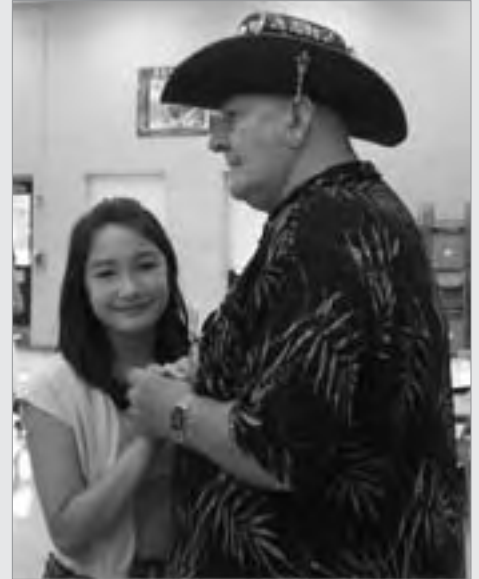
Seniors mingle with students at the Clarksville Middle School annual "Senior Prom."

The information provided is confidential and will not be shared outside of the Howard County Public School System.